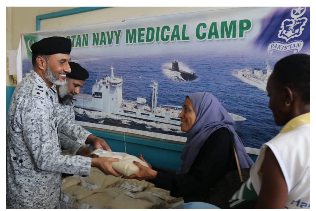
Mission Commander of PN Flotilla distributing ration at free medical camp established for local populace of Mombasa, Kenya during Overseas Deployment to African region