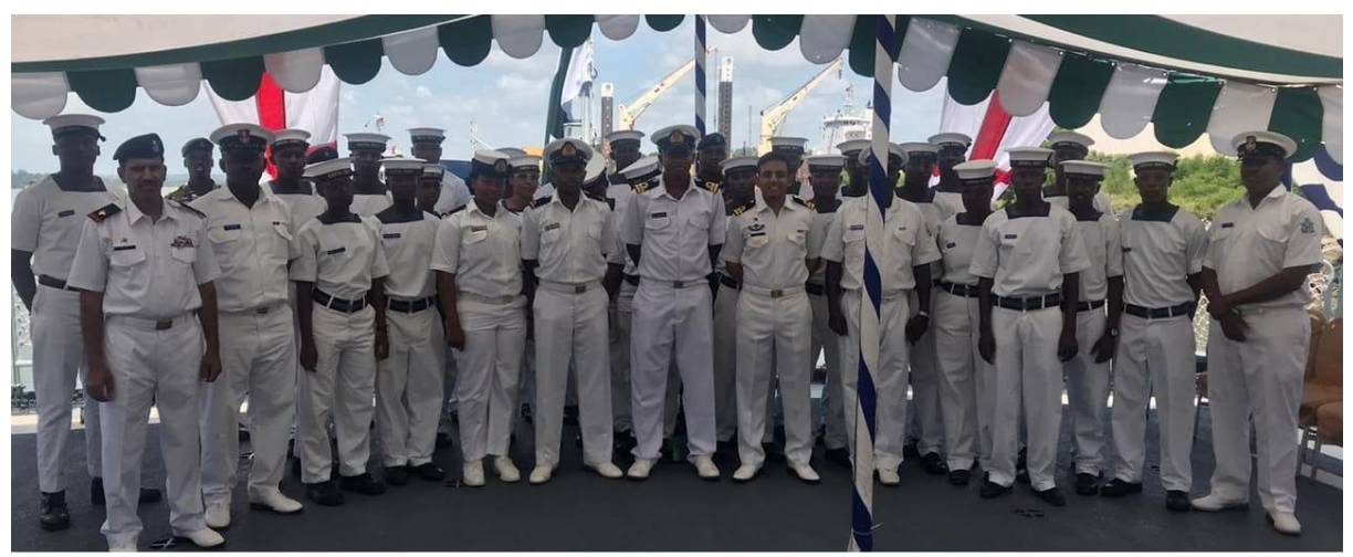
Group photo of Kenyan Navy officials onboard Pakistan Navy Ship ASLAT during port call to Mombasa, Kenya