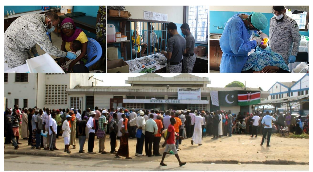
Pakistan Navy Ships ASLAT & MOAWIN visited Mombasa and established free medical camp for local populace of Kenya during Overseas Deployment to African region